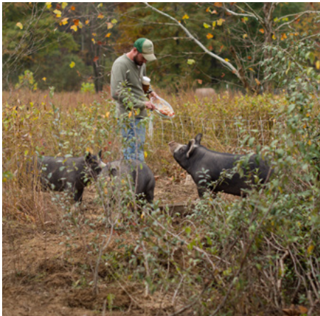
4. Luke 15:11-32