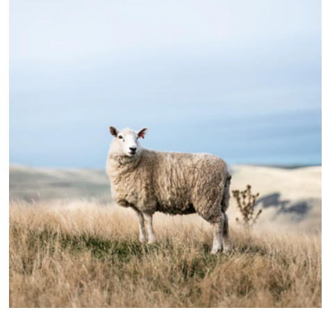
3. Luke 15:3-7