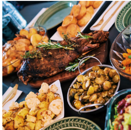
5. Matthew 22:1-14