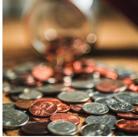
2. Matthew 25:14-30 or Luke 15:8-10