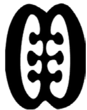
9. Ese ne Tekrema