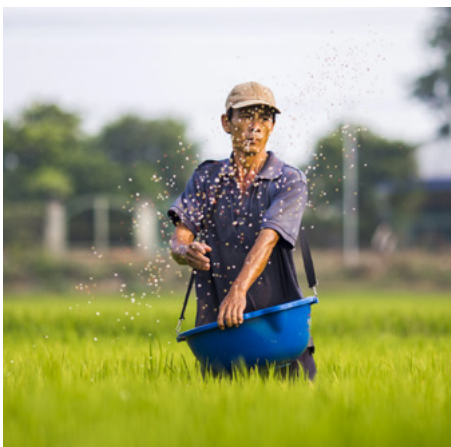
7. Matthew 13:1-9