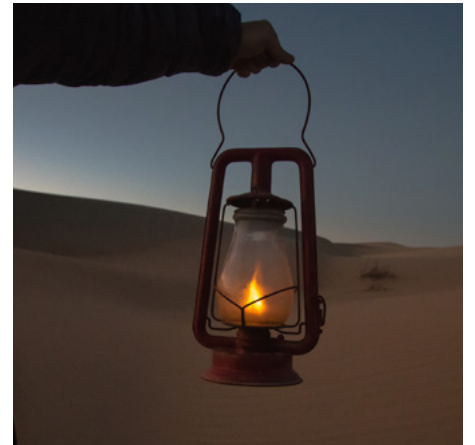
6. Matthew 5:14-16