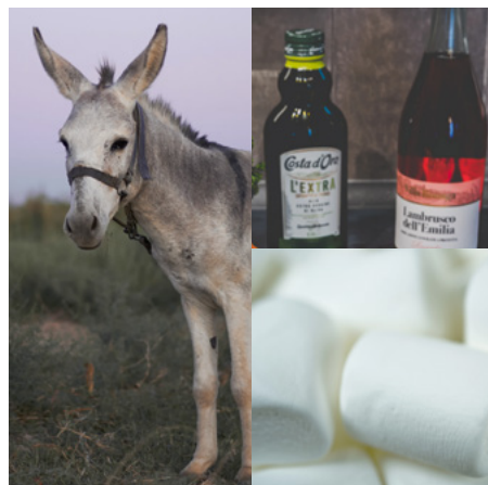
8. Mark 10:25