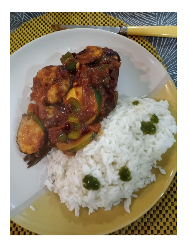
Wahoo steak, also delicious with stirfry & rice