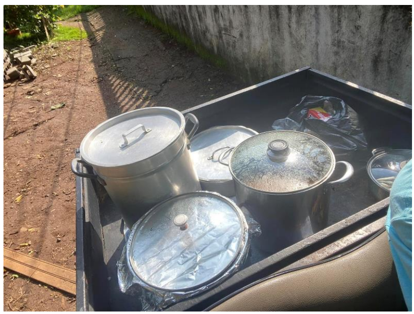
Preparing for the soup run