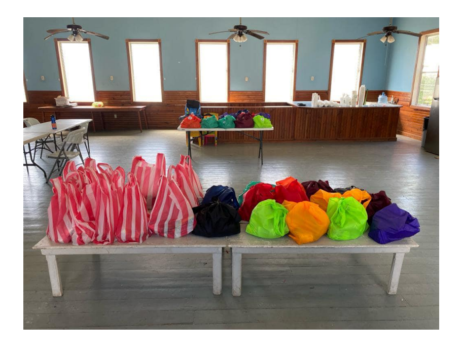
Food bags awaiting delivery