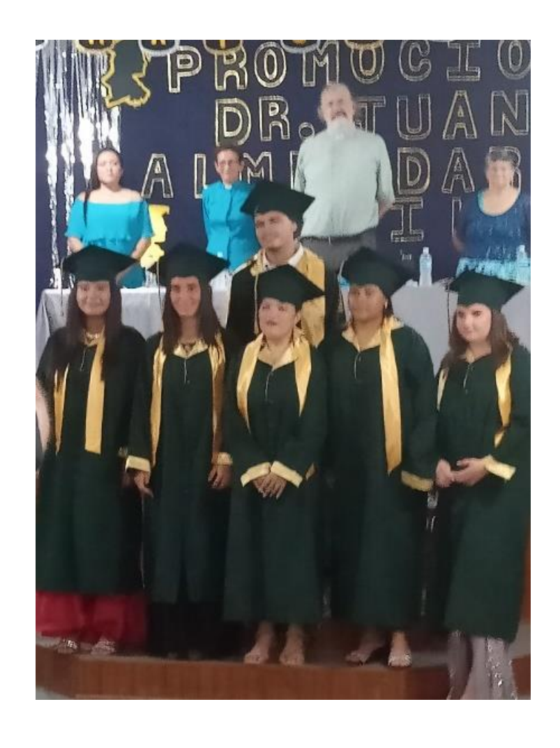
Eleventh grade graduation