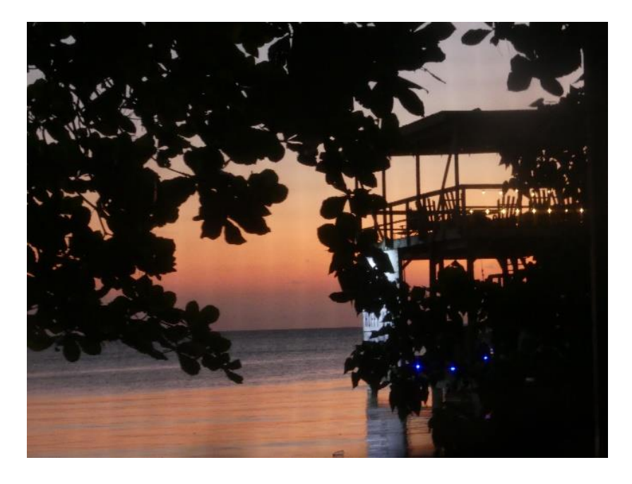
Back garden sunset