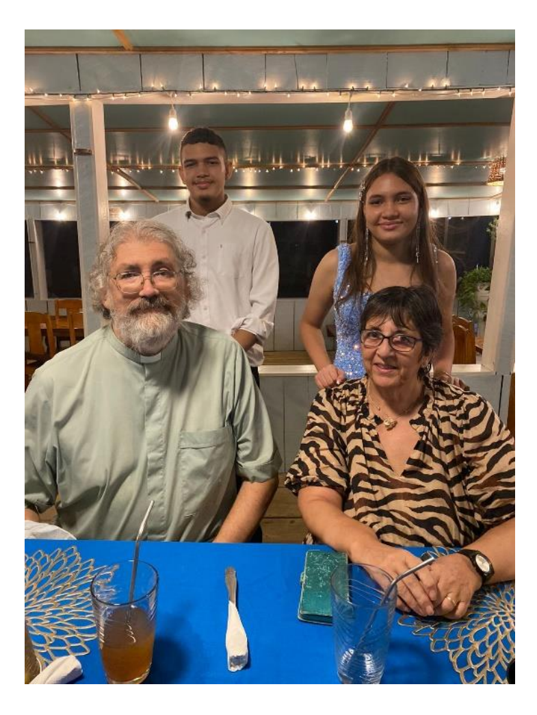
Graduation meal with the graduates