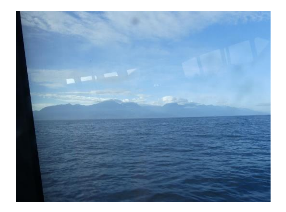
Pico Bonito from the ferry