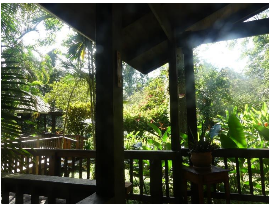
Lush tropical greenery