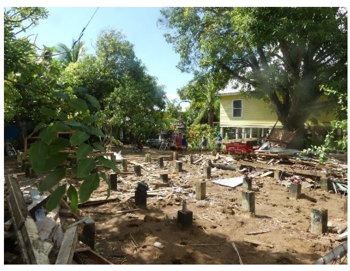
House demolition Utila style