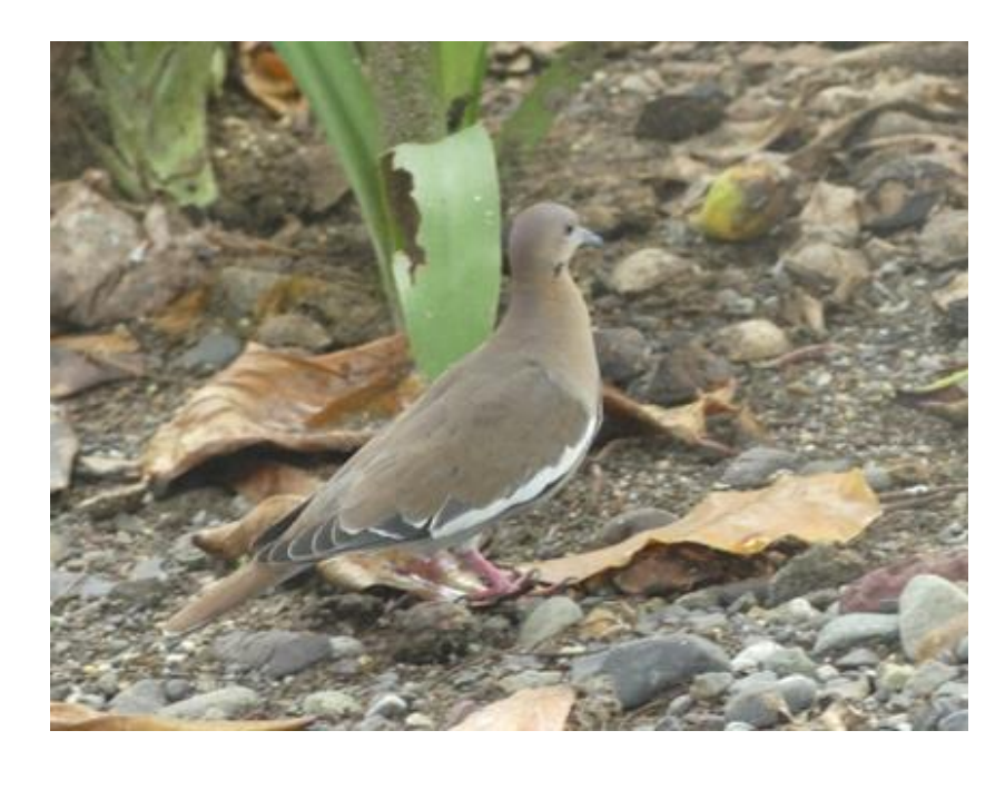
White-winged dove in the garden