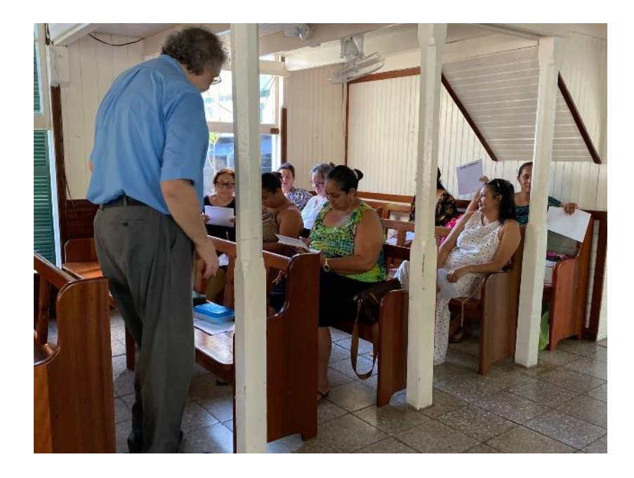
Teaching the adult class