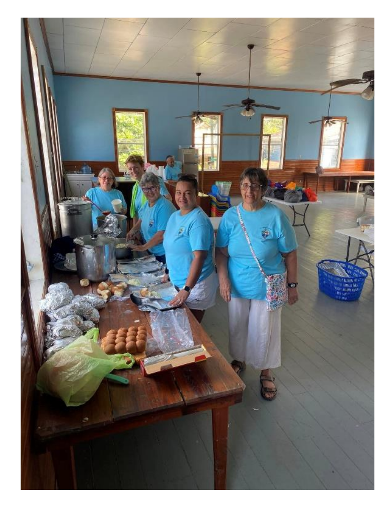
The delivery team