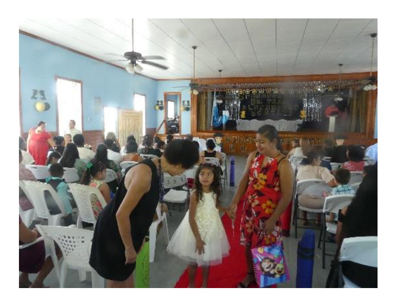
Teachers awaiting the Kinder graduation