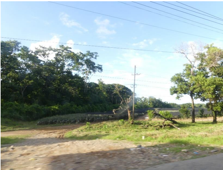
Pineapple farm near El Pino