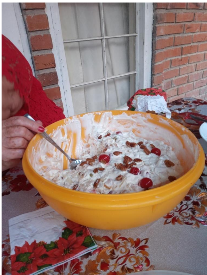
Utilian Christmas pudding