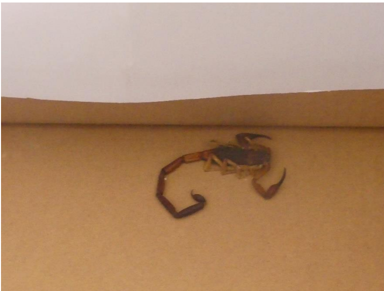
Brown bark scorpion