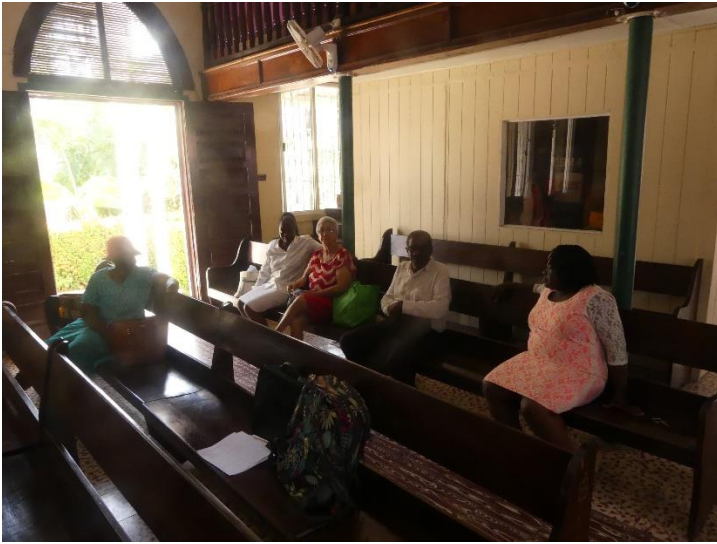
Local preachers' training, La Ceiba