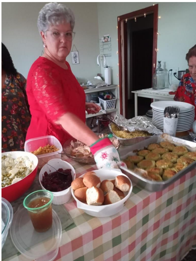
Christmas dinner, including turkey and stuffed chayotes