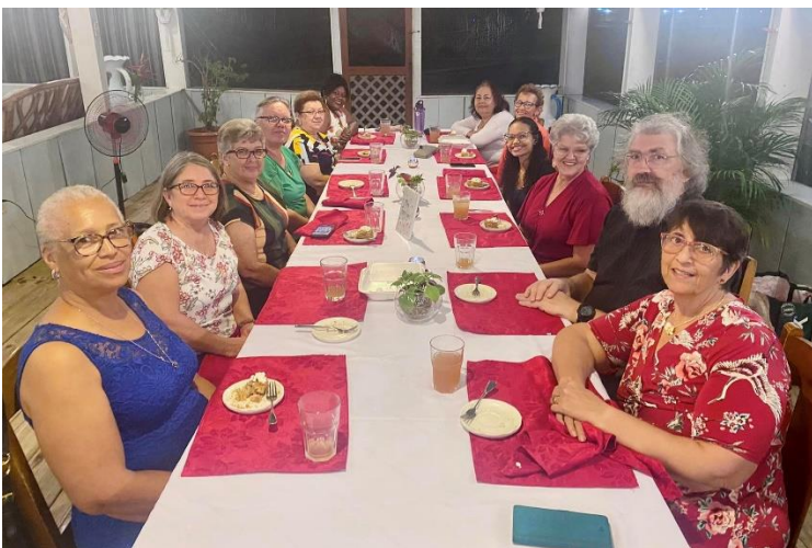
Sunday School teachers' dinner