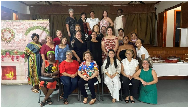
Ladies' group party photo