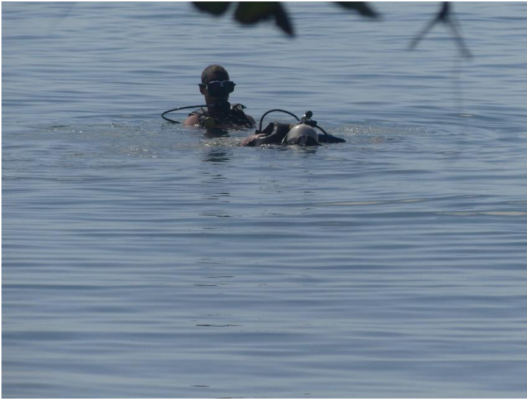
Frogmen in our garden