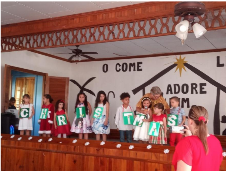
Angels on the stage