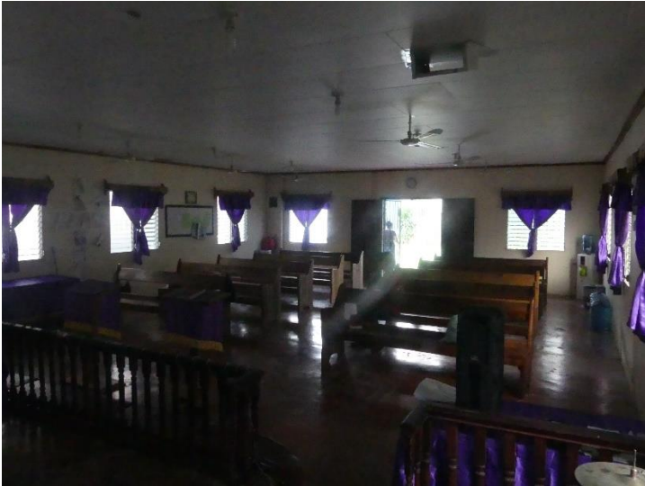
Inside church, El Pino