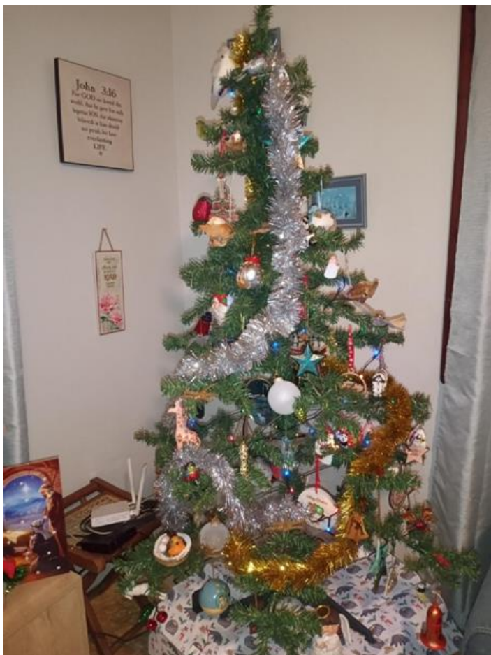
Our Christmas tree