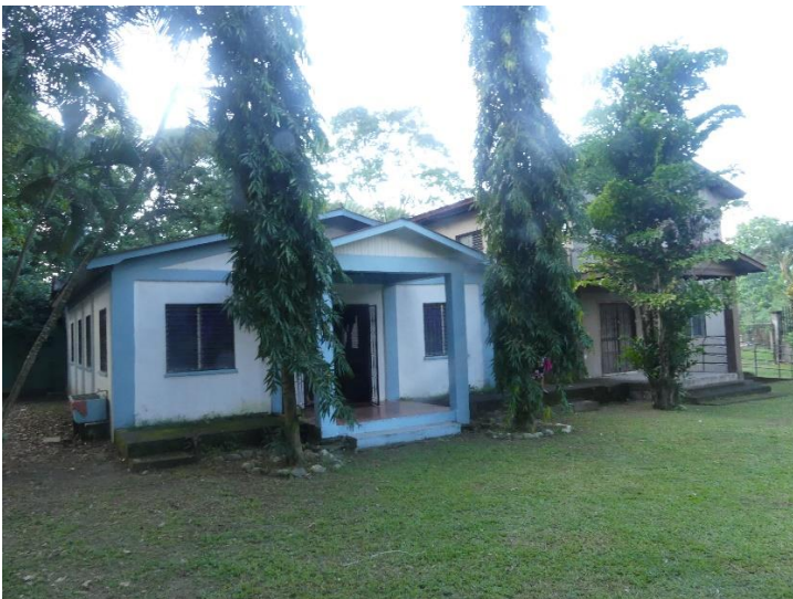
Emmanuel Methodist Church, El Pino