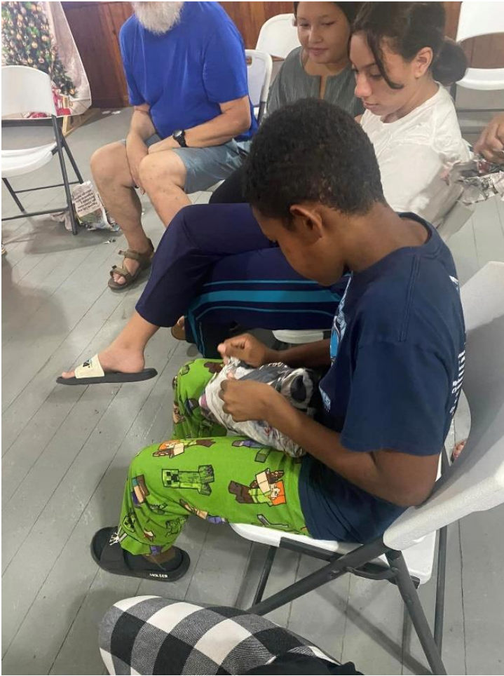
Unwrapping 'pass the parcel'