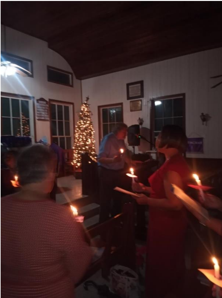
Candlelit service finale