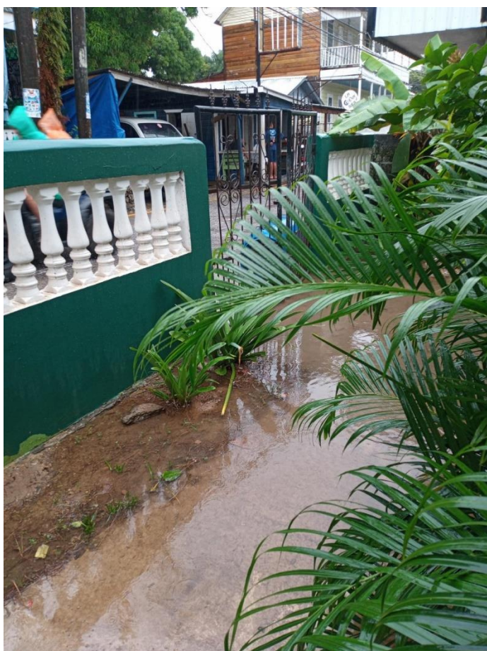
Section of moat leading to our gate