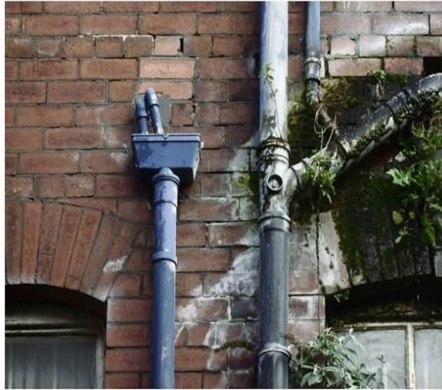
Leaking gutters or drainpipes are often the cause of damp walls. © Historic England Archive. DP169342

Guidance on Annual Property Inspections can be found here . As well, Churches for Cumbria Trust has created a useful Maintenance Checklist to assist those looking after church buildings.